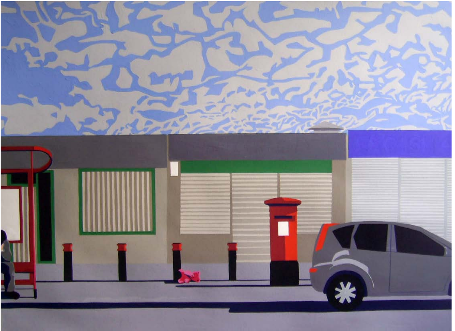
Early Morning , 2011, 105/75cm, Gouache on paper, one of a series