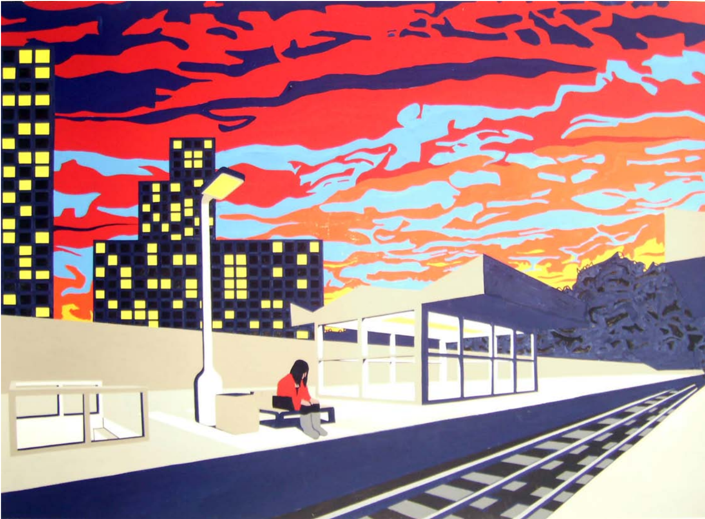
Train Platform , 2011, 105/75cm, Gouache on paper, one of a series